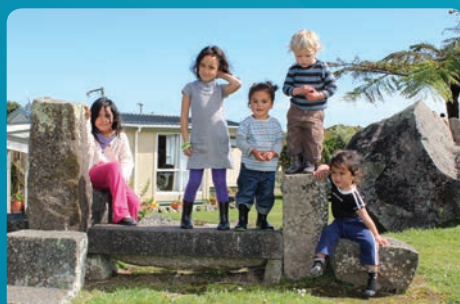
Children at Parihaka today

It also continues to be a place where people live with the legacy of colonisation. Several different small communities exist on the three marae of Parihaka. Questions of food, livelihoods and local organisation sit alongside concerns about ensuring a Māori voice within discussions about use of natural resources – such as the ‘black and white gold’ (oil and milk) of Taranaki.