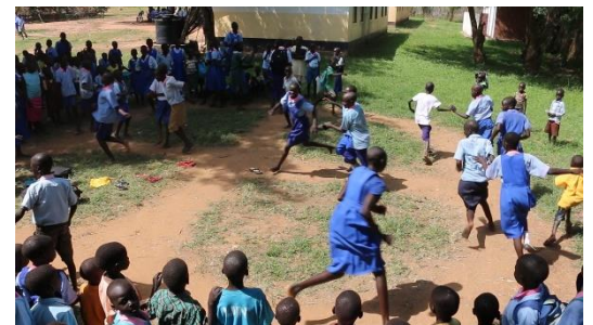
Children at St Theresa's Primary School in Torit play the game Are You Ready?

Changing the size of the circle and the out of bounds areas will change the level of difficulty for the tagger. A more extreme game would see multiple taggers with the additional rule that when players are tagged they become 'frozen'. When another free player touches them they can be saved and run once more.